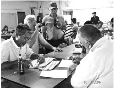
Golf scores tallied on Friday night.